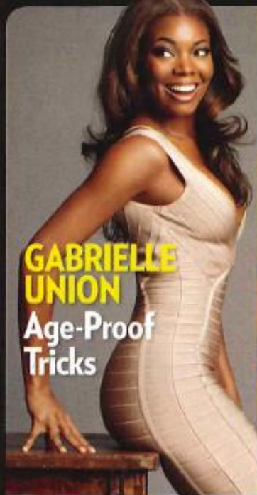
GABRIELLE UNION Age-Proof Tricks