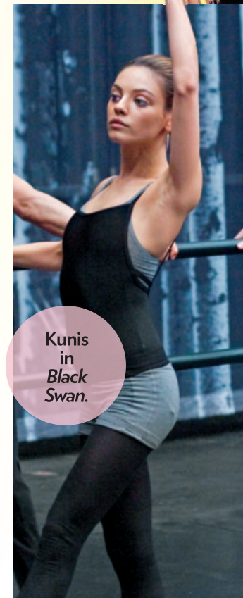
Kunis in Black Swan .